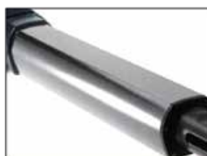
METAL FIXING PLATE