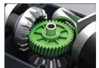
DU PONT WORM GEAR