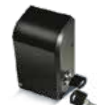
LATCH &amp; STOPPER